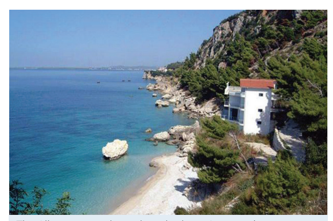
The Albanian coastline is breathtaking. As coastal tourism increases, so too does the potential for environmental and other damage.

Implementation delays in the reconstruction program could fuel domestic uncertainty and lower consumption.